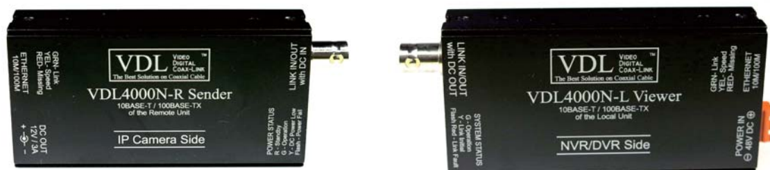
Fig. 1 VDL4000N-RU and VDL4000N-LU

If any of the above circumstances happen, the system will automatically try to reconnect recurringly. Once the condition is solved, the system will reconnect and supply power again.